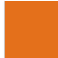
Safety Orange PES8-C6148