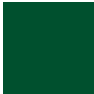
Fence Green PGS8-C0651