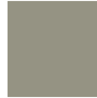
61 Gray PAS4-C2395