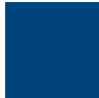
Blue Ribbon PLS8-C0002